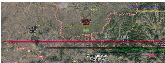
Figure 1.The location information of Zhangbei

Due to significant differences of external condition in the real world, photovoltaic modules as well as other parts of the installation are exposed to a broad range of irradiance and temperature changes. The rise of irradiation in the summer months is beneficial for the electric energy production but leads to the module temperature growth, which can decrease the efficiency of modules; however, it is beneficial for the N-TOPCon modules. The performance of panel is also influenced by the direction sunlight such as morning, dusk, cloudy, rain days, etc. During the low light part of the day, the drop of power of N-TOPCon is less influenced compared to P-PERC. According to the obtained data, the advantageous results are indicated that not only the energy density kWp/m2 but PV peak power kWh/kWp of N-TOPCon panels are higher than P-PERC in real external environment.