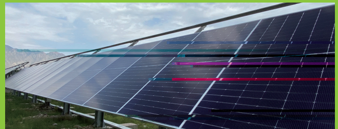
Figure 3. The project picture

Since irradiation, installation tilt, the ground albedo or the module height above the ground, the temperature, will impact on energy gain. The higher the albedo or the height above the ground, the more irradiation the rear side could receive from the surrounding environment, and thus the more power generation. If in the same installation environment and design, the N-TOPCon bifacial modules show dominant advantage in energy generation with lower operating temperature coefficient, higher bifaciality factor and superior low light performance in the morning, dusk and cloudy days.